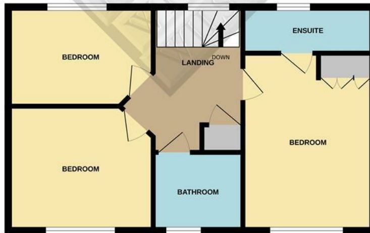
TOTAL FLOOR AREA : 1037 sq.ft. (96.4 sq.m.) approx.

Whilst every attempt has been made to ensure the accuracy of the floorplan contained here, measurements of doors, windows, rooms and any other items are approximate and no responsibility is taken for any error, omission or mis-statement. This plan is for illustrative purposes only and should be used as such by any prospective purchaser. The services, systems and appliances shown have not been tested and no guarantee as to their operability or efficiency can be given.